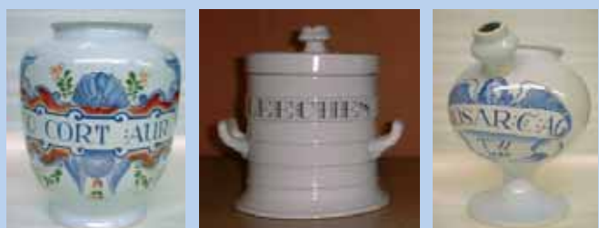
The seven replica drug jars available from the museum