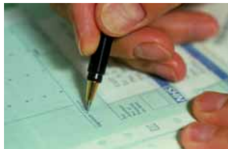
Medicines are prescribed generically in 82 per cent of cases, says the APBI

The committee found that around a quarter of all primary care spending is on drugs and both the volume prescribed and their costs are rising. "Efficient management by the DoH and NHS bodies can, however, make the drugs bill more affordable without affecting patient care," the report says. "There are a number of examples of good practice where