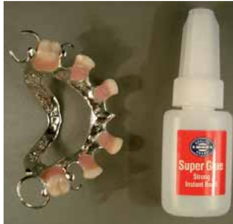
Superglue can be used, with caution, to repair dentures

Vincent's infection is ulceration and bleeding of the tips of the gums in between the teeth, associated with a characteristic bad smell. It is more common at times of stress and can be countered with hydrogen perox-