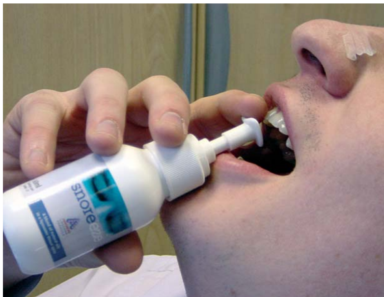
Anti-snoring aids include nasal strips and essential oil-based sprays

conducted some trials and collected reports from patients on the effectiveness of commercially available anti-snoring aids (see Resources).