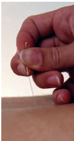
Other interventions for managing pain include acupuncture

Pentazocine is a partial agonist at \delta and \kappa receptors and antagonist at \mu receptors. At low doses, pentazocine has a potency similar to