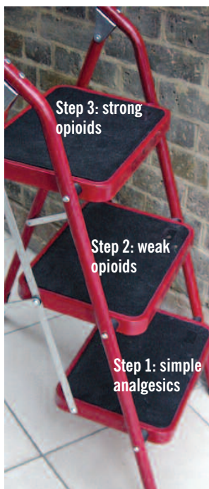
In post-operative pain, analgesia may be started at a higher rung and stepped down

Opioids are thought to mimic the action of the endogenous pain killing peptides, endorphins, dynorphins and enkephalins. They work best for dull pain (mediated by C fibres) and are not as effective for sharp pain. If comparisons are to be made between opioids in terms of potency or adverse effect profile,