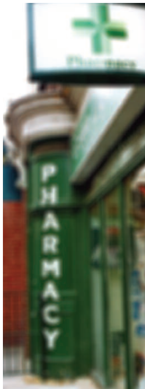
Blurred vision can be caused by cataracts

Most people with cataracts have similar changes in both eyes, although one eye may be worse than the other. Many have minimal