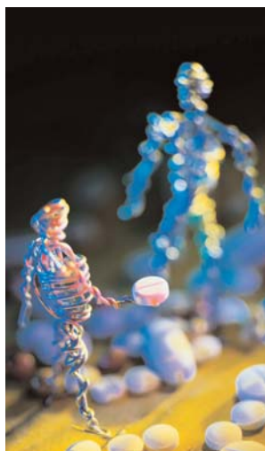
Drug availability and safety issues frequently made the headlines

Palonosetron Cancer patients suffering the effects of emetogenic chemotherapy now have