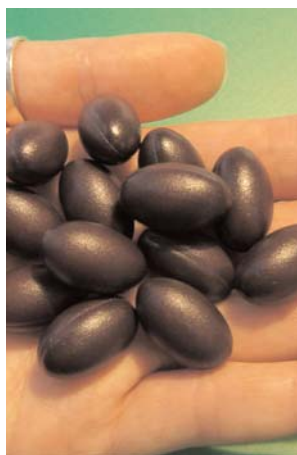
Zinc supplements commonly contain a daily dose of up to 15mg of elemental zinc

High zinc intake (100–150mg/day) reduces copper absorption by competition. Zinc forms complexes with tetracyclines, quinolones and also non-steroidal anti-inflammatory drugs and doses should be separated by two hours. Acute zinc toxicity is rare, but typical signs include epigastric pain, diarrhoea, nausea, vomiting, bad taste and discomfort in the mouth and throat. Doses above 200mg/day are typically emetic and may be vomited before absorption can occur. The major consequence of chronic long-term ingestion of excessive zinc supplements (ie, 100–150mg zinc/day) is induction of a secondary copper deficiency with anaemia and neutropenia. Impaired