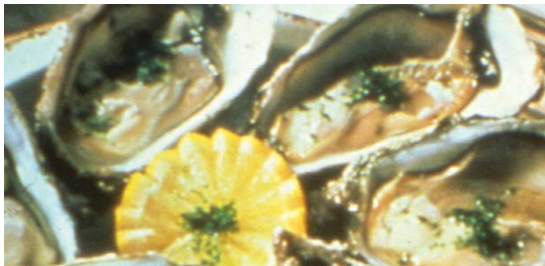
Shellfish are a good source of zinc

Zinc is present in a number of products available from pharmacies and its efficacy in “boosting the immune system” has been much debated. In this article, Pamela Mason gives an overview of this important trace mineral and its possible uses