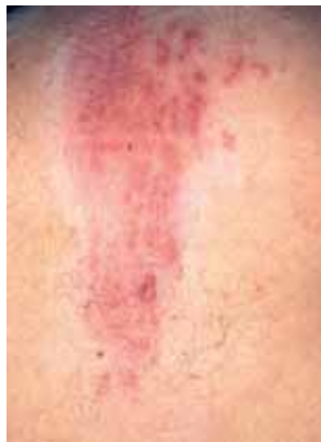
The shingles rash is usually localised