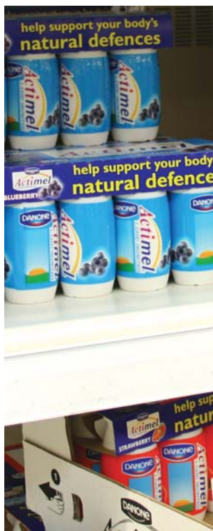
Claims on probiotic products include helping to support the body’s natural defences