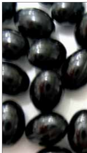
Vitamins capsules contain six vitamins

The multivitamin section in the current British National Formulary (section 9.6.7) contains just seven products compared with 23 in BNF 6 (1983). Vitamins were one of the categories affected by the introduction of a limited prescribing list in 1985 and fewer products were included on the “white list”. Sejal Amin, staff editor on the BNF, comments: “The reason that only seven multivitamin preparations appear in the BNF is because they are not blacklisted and are commonly prescribed. There are many multivitamin preparations available over the counter, however the BNF does not include details of products sold OTC and promoted to the public. Moreover, the BNF takes the view that vitamin supplementation is rarely necessary and that, in deficiency, a specific vitamin can be prescribed as needed but attention should probably focus on diet.”