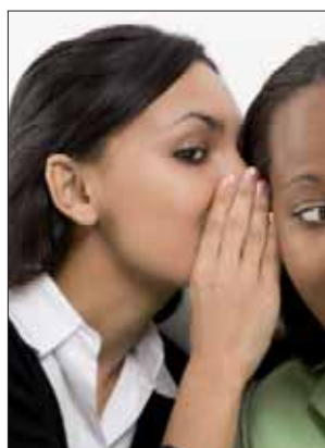
If confidentiality were not the norm, health care would be undermined