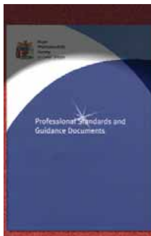
The Society has published standards and guidance for patient confidentiality

Lack of capacity The legal concept of capacity (discussed in the second article of this series; PJ , 13 October, pp411–4) is equally applicable to consent to disclosure of information. A patient's parent, guardian or carer may give consent to a disclosure if the patient is deemed by law to lack capacity to consent (as