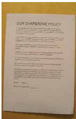
The desirability of a chaperone policy in pharmacies has been highlighted

No standard has been set for compliance with this principle but there are likely to be developments soon. In April 2007, the Council for Healthcare Regulatory Excellence (CHRE), which oversees the regulation of all health care professions, announced proposals for guidelines to regulate sexual behaviour between every health professional and his or her patients. The CHRE is also pressing for a new mandatory responsibility on universities, regulatory bodies and