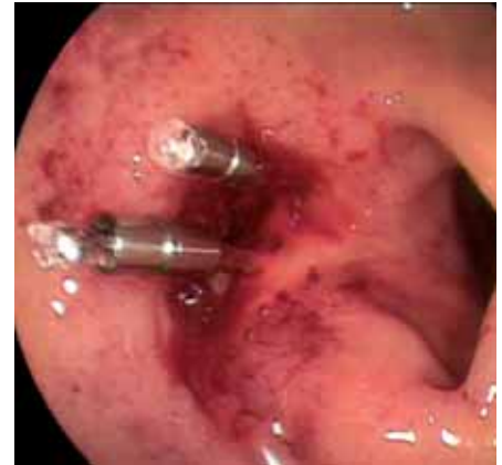
Figure 2. Endoclips on a duodenal ulcer

Effective endoscopic therapy reduces the need for surgery in peptic ulcer bleeding. However, despite advances in this field endoscopic therapy has failed to alter the mortality rates related to upper gastrointestinal bleeding, which currently stand at 10–14 per cent. This is mainly due to the presence of significant comorbidity.