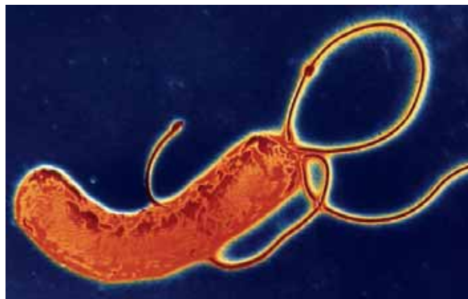
Helicobacter pylori bacteria are usually present in patients with peptic ulcers

This article, the first in a special feature on the condition, describes the clinical features and diagnosis of the disease