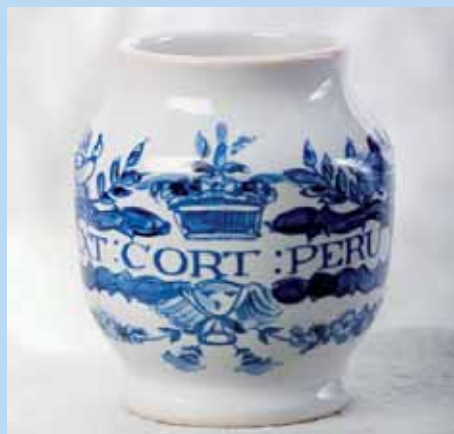
Museum of the Royal Pharmaceutical Society

The original jar was made in tin-glazed earthenware, or delftware. The inscription on the jar, "EXT CORT PERU", is an abbreviation of the Latin for extract of Peruvian bark.